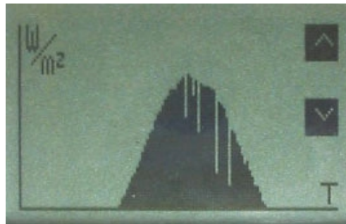
Graphic display 00H /24H

Scrolling of the successive graphs 00H-24H